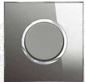
Reflective Stainless Steel