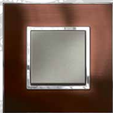
Brushed Pink Champagne

Urban luxury combined with the appeal of unspoilt nature is the theme of this collection. All this can be experienced through the premium materials and first-rate craftsmanship used to produce these finishes. The particularly attractive brushed surfaces lend a rough yet naturally elegant charm to any room.