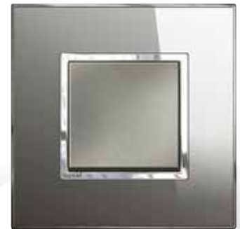
Reflective Stainless Steel