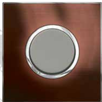
Brushed Pink Champagne